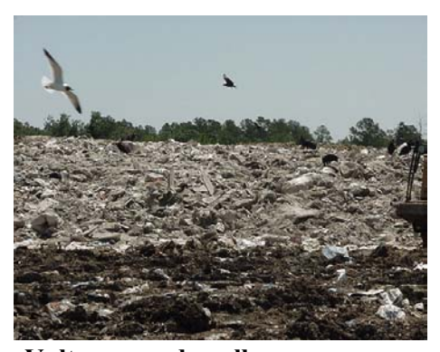
Vultures and gulls scavenge an active landfill.

In other instances of poisoning, small animal carcasses from veterinary practices or humane shelters have been legally deposited in a landfill but then left exposed to scavengers because they were not covered over in a timely manner by the landfill workers. In these instances, problems with landfill regulations or management practices