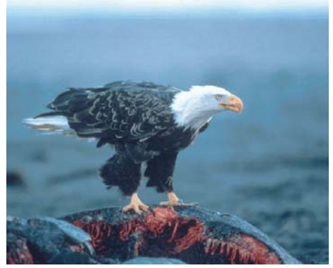
Bald eagle perched on whale carcass.

/ Euthanasia methods such gunshot a s penetrating captive bolt have been used on free-ranging wildlife by specially trained personnel in cases where burial or other methods of disposal were unavailable. While pentobarbital injection is generally the preferred method of humane euthanasia, there are some instances involving field euthanasia of wildlife by law enforcement or other wildlife professionals in which the carcass must be left exposed in the field (e.g. when frozen ground prevents burial). According to the AVMA Panel on Euthanasia<sup>1</sup>, in these situations "...a gunshot to the head, penetrating captive bolt, or injectable agents that are non-toxic (potassium chloride in combination with a non-toxic general anesthetic) should be used so that the potential for scavenger or predator toxicity is lessened." While a discussion of these alternate methods is beyond the scope of this fact sheet, it must be emphasized that they are last resort procedures restricted to use by trained, authorized personnel, where no other options are available.