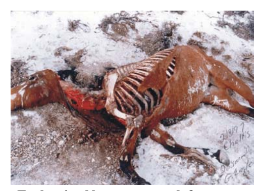
Euthanized horse carcass left on open ground, scavenged by eagles and other carrion feeders.

When an animal is euthanized via pentobarbital injection, the drug is quickly distributed throughout its body. Well-vascularized organs such as the liver will have especially high concentrations of pentobarbital, but other tissues will also contain residues. When a scavenger feeds on the carcass, the degree of intoxication will depend on the