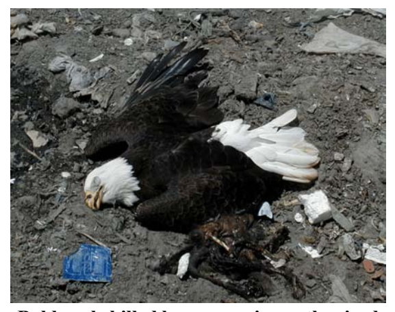
Bald eagle killed by scavenging euthanized cat in Florida landfill.

Euthanasia by sodium pentobarbital injection is a humane way to end the life of a suffering animal, and is recommended for many species by the American Veterinary Medical Association (AVMA) Panel on Euthanasia. Ironically, this compassionate act can sometimes have the unintended consequence of causing the premature death of other animals. Each year a number of bald and golden eagles, other wildlife, and