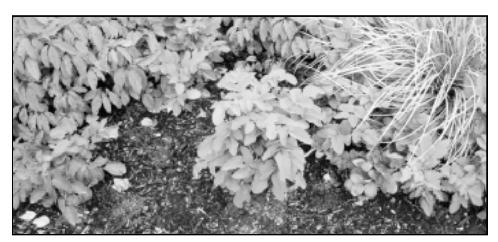
Mulches are an excellent tool for reducing weed problems.